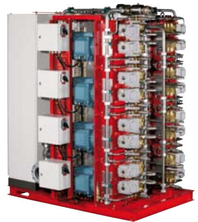
Electric driven pump unit (SPU)

Marioff Corporation Oy PL 86, 01301 Vantaa, Finland Tel: +358 (9) 870 851 Fax: +358 (9) 8708 5399 Email: info@marioff.fi