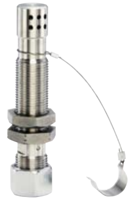
HI-FOG® duct protection spray head

After fire-tests series supervised by FM, including different length cookers with exhaust hoods both in the lower cooking and upper maintenance positions, Marioff's HI-FOG® system utilizing electric-powered pump is FM approved for the protection of industrial cookers.