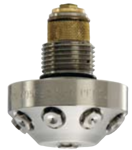
HI-FOG® spray head