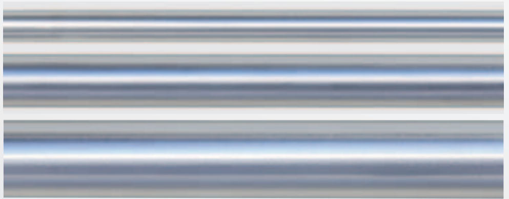
The HI-FOG® system uses small diameter stainless steel tubes.