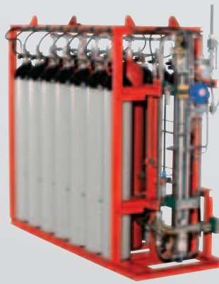
HI-FOG® gas-driven pump unit (GPU)