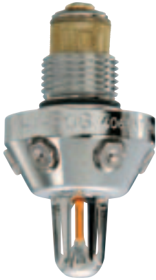
HI-FOG® 1000-series sprinkler