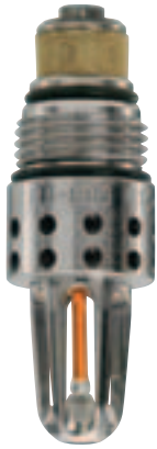
HI-FOG® 2000-series sprinkler