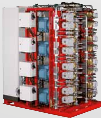
HI-FOG® electric pump unit (SPU)