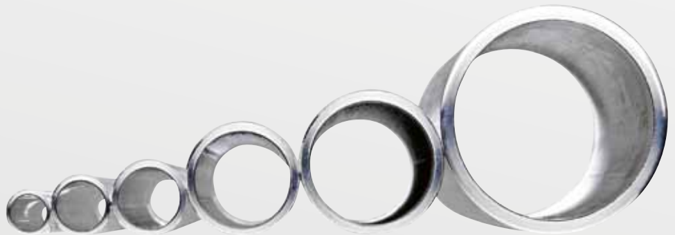
12mm - 60mm stainless steel tubes