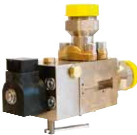
Machinery space section valve