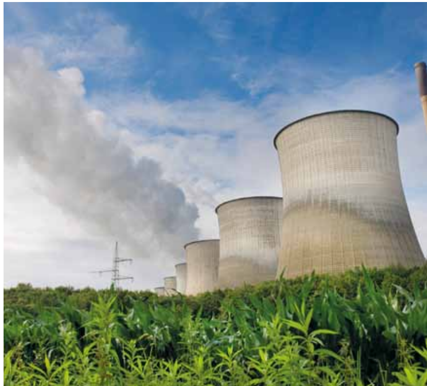
A single, central pump can feed the HI-FOG® tubing network protecting buildings above ground, as well as the network protecting underground infrastructure.

Fire protection regulations for these tunnels are being toughened, and HI-FOG® is ready to respond. The HI-FOG® water mist fire protection system is a compact, high performance solution that excels in challenging conditions underground, making it ideal for cable tunnels.