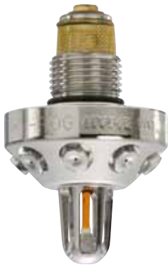
HI-FOG® 1000-series sprinkler