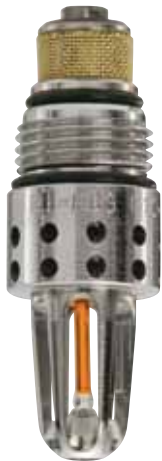
HI-FOG® 2000-series sprinkler