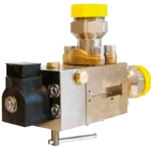
Machinery space section valve

The HI-FOG® system is fed by a single HI-FOG® pump unit, capable of supplying up to 1210 litres per minute at high pressure. The pump unit uses a modular configuration with built-in redundancy that ensures reliable operation.