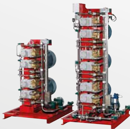
Modular electric pump unit (MSPU)

The HI-FOG® system is controlled and monitored from a manned control centre. The monitoring systems include smoke and gas detectors as well as closed circuit video. The HI-FOG® system can be activated from the control centre or from manual call points adjacent to the conveyors.