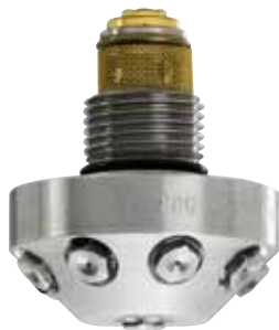
HI-FOG® spray head