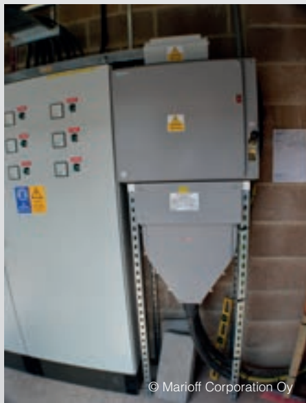
Control panels and dedicated incoming electrical supply.