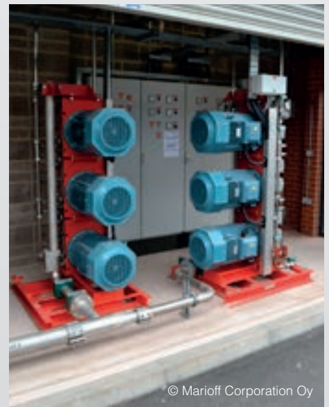
The modular pump units and control panels to the rear.